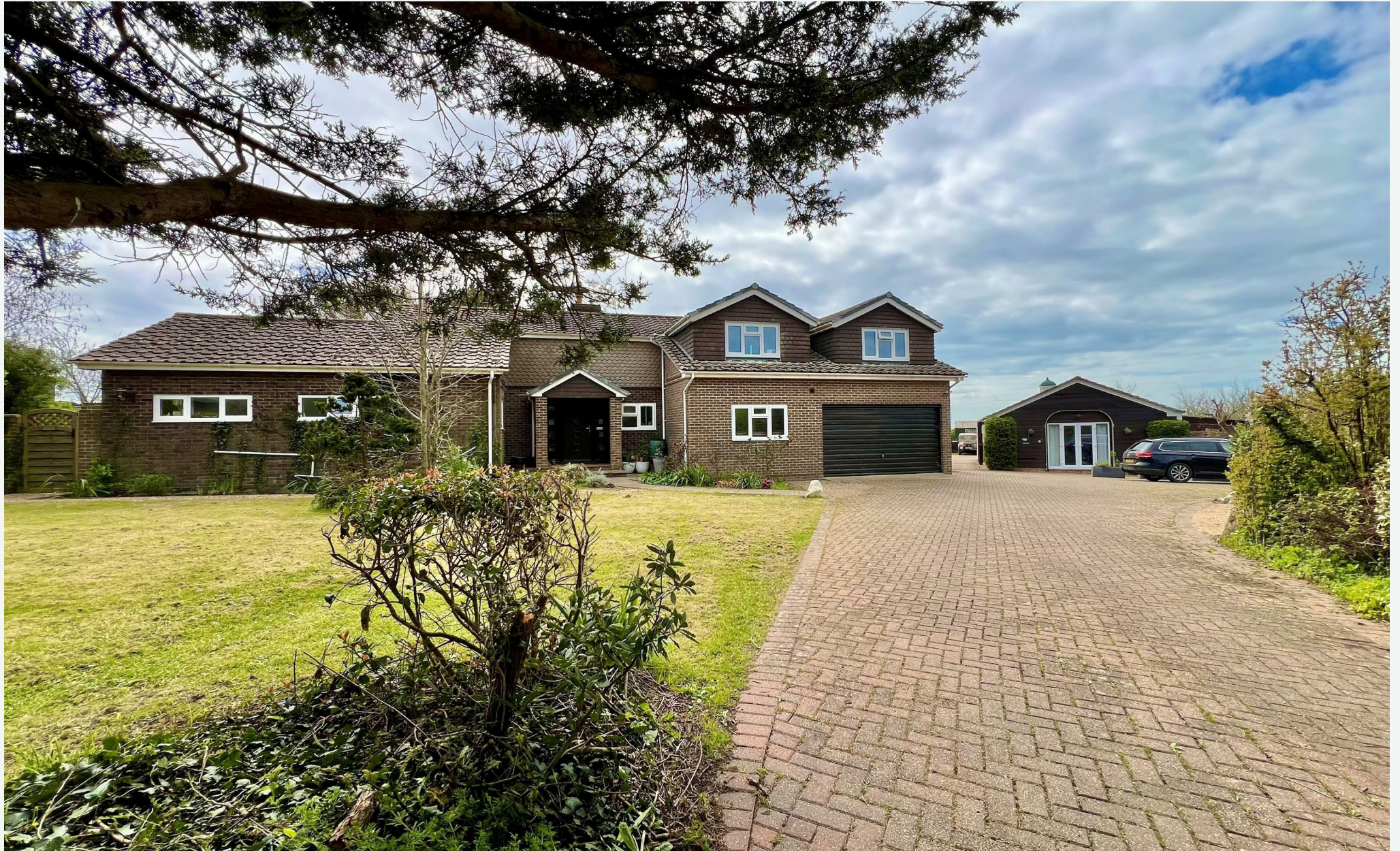
Moorfield Chase, Chilton Lane, Brighstone, Isle of Wight, PO30 4DR